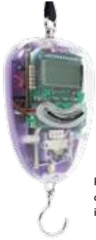
Print transparent, functional components and housings to see internal workings as assembled