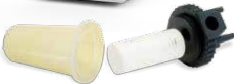
Functional filter prototype printed in clear, white and black rigid plastics

VisiJet M3 materials line delivers toughness, durability, stability, high temperature resistance, watertightness, biocompatibility and castability.