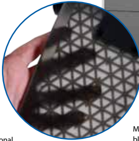
Multi-material prototypes can blend clear, black and white to communicate ideas and simulate finished products